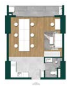
49,81 - 49,82sqm