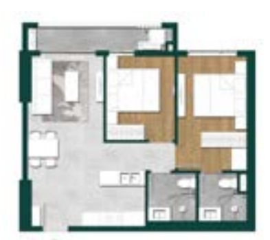
68,05 - 71,17sqm